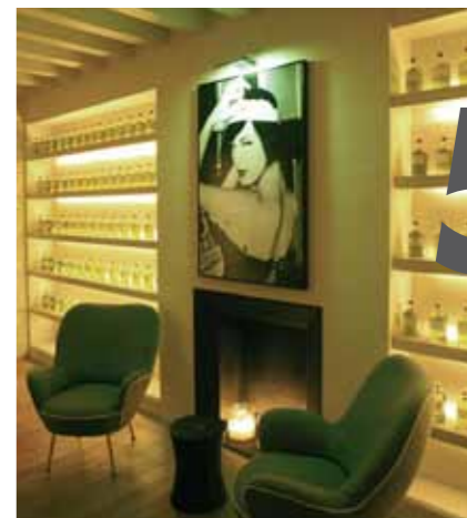
5 LUNGARNO HOTELS, FLORENCE, ITALY + www.lungarnohotels.com

Each of Hotel Petit Moulin's 17 rooms packs a seriously-designed punch, all thanks to haute couture master Christian Lacroix. You won't find understated elegance here: it's all about red walls, murals sketched in a rainbow of colours and extravagant details such as heart-shaped mirrors and polka-dotted floors, all in the heart of the trendy Marais district. The site, which was an ancient bakery, captured Christian Lacroix with its "slightly twisted perspectives, the maze-like passageways on the different floors and the new functional areas which have been added in full respect of the 'old Paris' style of the classified parts of the building".