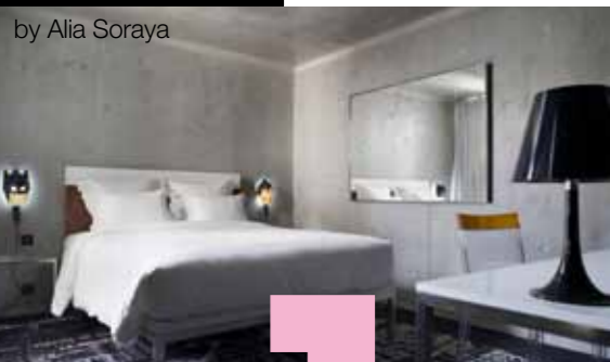
MAMA SHELTER, PARIS + www.mamashelter.com