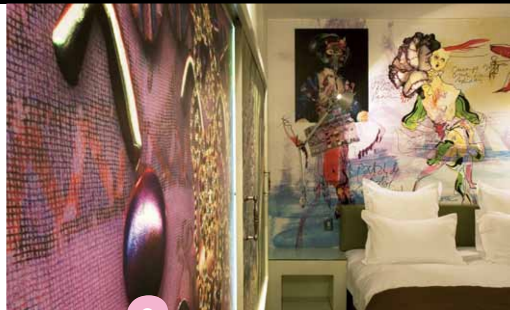
HOTEL PETIT MOULIN, PARIS/ CHRISTIAN LACROIX + www.paris-hotel-petitmoulin.com

Each of Hotel Petit Moulin's 17 rooms packs a seriously-designed punch, all thanks to haute couture master Christian Lacroix. You won't find understated elegance here: it's all about red walls, murals sketched in a rainbow of colours and extravagant details such as heart-shaped mirrors and polka-dotted floors, all in the heart of the trendy Marais district. The site, which was an ancient bakery, captured Christian Lacroix with its "slightly twisted perspectives, the maze-like passageways on the different floors and the new functional areas which have been added in full respect of the 'old Paris' style of the classified parts of the building".