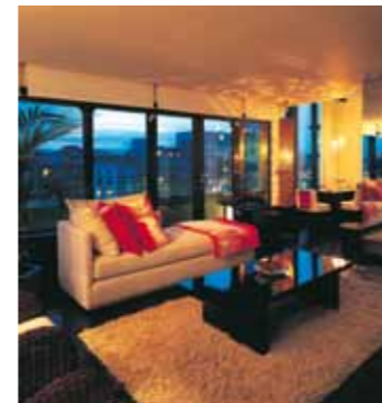
THE MORRISON IN DUBLIN BY JOHN ROCHA + www.morrisonhotel.ie

John Rocha is known as the Calvin Klein of the UK, and his sleek, east-meets-west aesthetic has drawn celebrities like Christina Aguilera, Beyoncé and Kate Moss, among others. The furnishings are quiet, varying more in texture than colour. Smooth stone floors are punctuated with gray handmade carpets, while furnishings add splashes of orange and gold. The building incorporates the 18th-century façade of a Georgian townhouse with a contemporary, south-facing front onto the River Liffey.