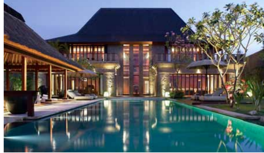
BULGARI HOTELS AND RESORTS, MILAN AND BALI + www.bulgarihotels.com

Originally the private haven of style icons such as Noel Coward, Babe Paley, Cole Porter, Grace Kelly and Jacqueline Kennedy, this fabled gem still feels like a charming private club, sought after by some of today's most discerning travelers. Ralph Lauren transformed this former pineapple and coconut plantation into an elegant yet laid-back resort just west of Montego Bay. The 36 ocean-front rooms in the Pineapple House have been recently renovated and most of the 27 private villas have their own pool. The atmosphere is relaxed, with white stone floors, mahogany and bamboo four-poster beds and understated Ralph Lauren Home collect furniture complimenting the bay views.