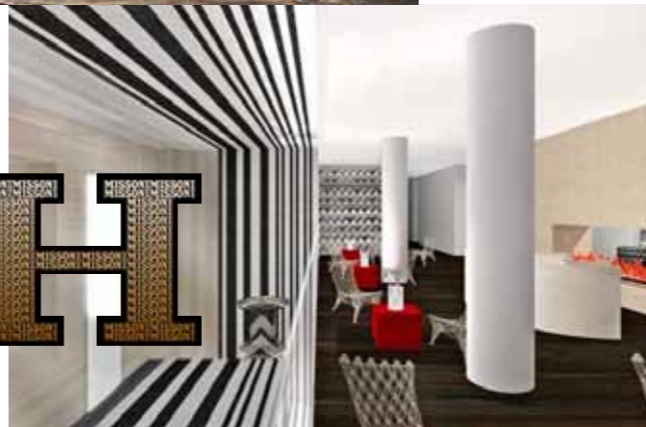
HOTEL MISSONI IN EDINBURGH, SCOTLAND AND KUWAIT CITY + www.hotelmissoni.com

The Missoni fashion house opened at the Edinburgh hotel in early 2009, featuring a unique blend of Missoni-branded products and services, from signature zigzag-print bed sheets to Italian restaurant Cucina Missoni. The Edinburgh location boasts 136 rooms, while Kuwait City's hotel opening in early 2010 will host 200 rooms. Both hotels house furnishings inspired by founder Rosita Missoni's own home, including Hans Wegner's signature Wish Bone chair, a mid-century favorite with a y-shaped backbone. Other future destinations are Cape Town, South Africa in Fall 2010, Oman in 2011 and Brazil in 2012.