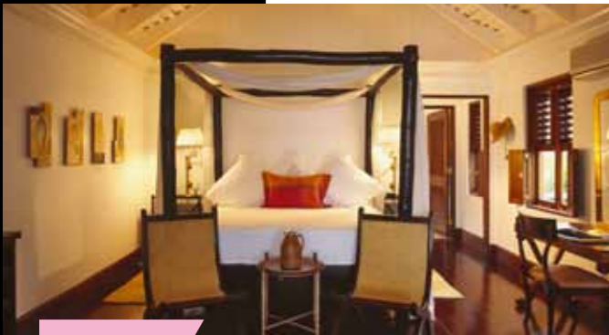
ROUND HILL HOTEL, JAMAICA BY RALPH LAUREN + www.roundhilljamaica.com

Originally the private haven of style icons such as Noel Coward, Babe Paley, Cole Porter, Grace Kelly and Jacqueline Kennedy, this fabled gem still feels like a charming private club, sought after by some of today's most discerning travelers. Ralph Lauren transformed this former pineapple and coconut plantation into an elegant yet laid-back resort just west of Montego Bay. The 36 ocean-front rooms in the Pineapple House have been recently renovated and most of the 27 private villas have their own pool. The atmosphere is relaxed, with white stone floors, mahogany and bamboo four-poster beds and understated Ralph Lauren Home collect furniture complimenting the bay views.