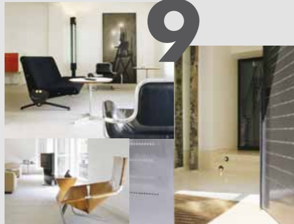
3 ROOMS, PARIS, FRANCE BY AZZEDINE ALAIA + www.3rooms-10corsocomo.com

This micro-boutique hotel comprises three apartments (one 1-bedroom and two 2-bedrooms), attached to designer Azzedine Alaïa's atelier, in partnership with shoemaker/hotelier Carla Sozzani. Much like his fashion, Alaïa's interiors are sleek and minimalistic, with the occasional pop of red. Alaïa uses both new and vintage objects to furnish the space. He also has another hotel in Milan with the same 3-room concept.