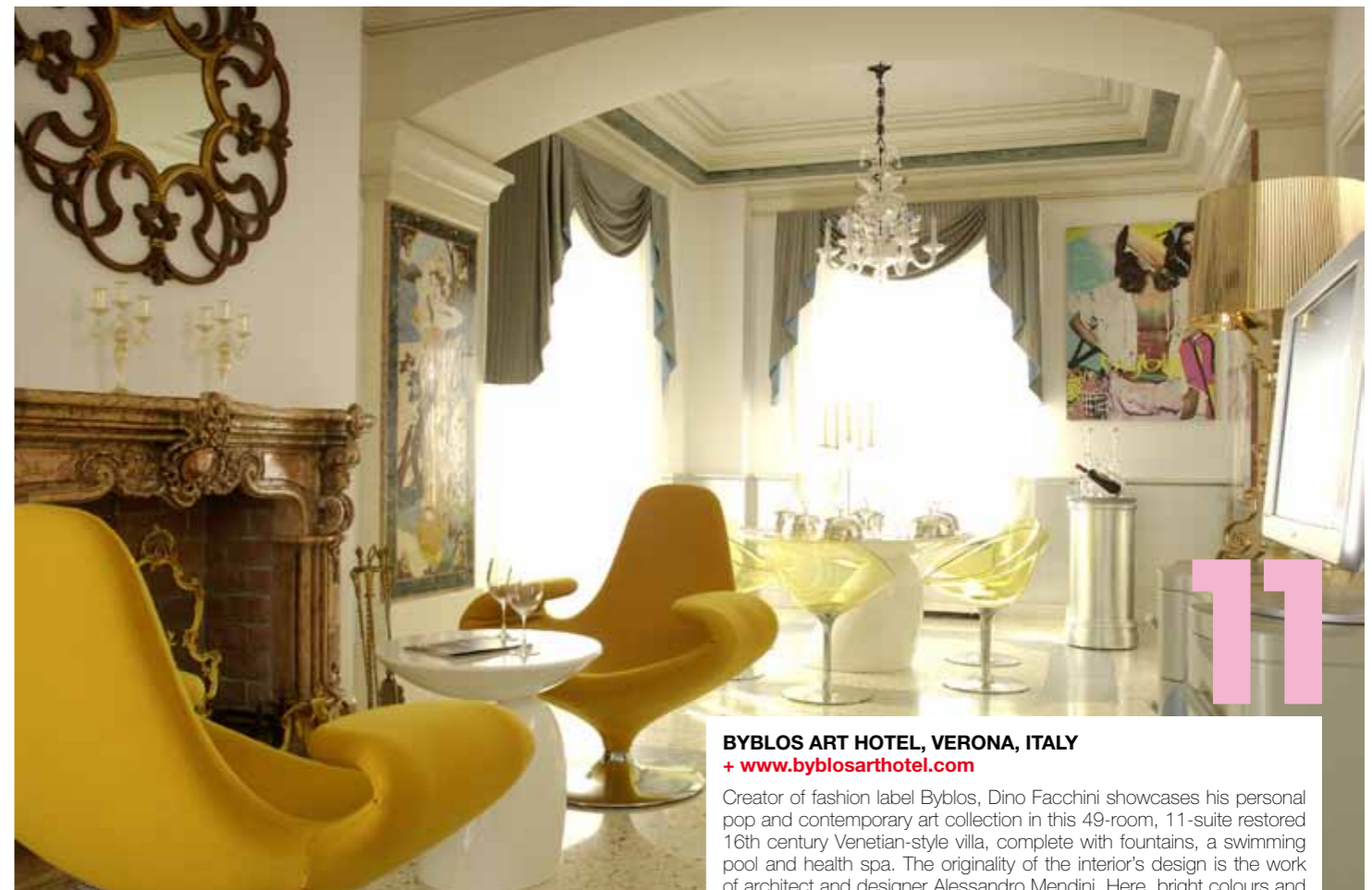
BYBLOS ART HOTEL, VERONA, ITALY + www.byblosarthotel.com

Creator of fashion label Byblos, Dino Facchini showcases his personal pop and contemporary art collection in this 49-room, 11-suite restored 16th century Venetian-style villa, complete with fountains, a swimming pool and health spa. The originality of the interior's design is the work of architect and designer Alessandro Mendini. Here, bright colours and plastic shapes are combined with paintings and marble elements to create a permanent exhibition of some of the world's best artists and designers. Signature looks that echo the label's ethos include colours, glamour prints and fabric patchworks.