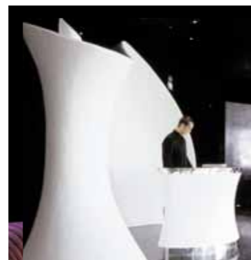
THE G HOTEL, GALWAY BY PHILIP TREACY + www.theghotel.ie

This micro-boutique hotel comprises three apartments (one 1-bedroom and two 2-bedrooms), attached to designer Azzedine Alaïa's atelier, in partnership with shoemaker/hotelier Carla Sozzani. Much like his fashion, Alaïa's interiors are sleek and minimalistic, with the occasional pop of red. Alaïa uses both new and vintage objects to furnish the space. He also has another hotel in Milan with the same 3-room concept.