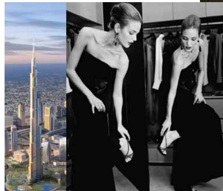
ARMANI HOTEL, DUBAI AND MILAN + www.armanihotels.com

Along with 175 guest rooms and suites, Armani's first hotel will include 160 luxury condominiums, a private member's club, five restaurants and a spa. The rooms are furnished with a specially-designed line of Armani Casa products including bespoke furnishings made out of zebrawood, Venetian plaster, fabric and leather wall coverings – all depicting Armani's credo of understated luxury. The opening was scheduled for 2009 but now, it's set to open early 2010. The Milan hotel will feature 95 guestrooms, a gourmet restaurant, a luxurious Armani/SPA and a fully-equipped business centre. Future destinations include Marassi and Marrakech.